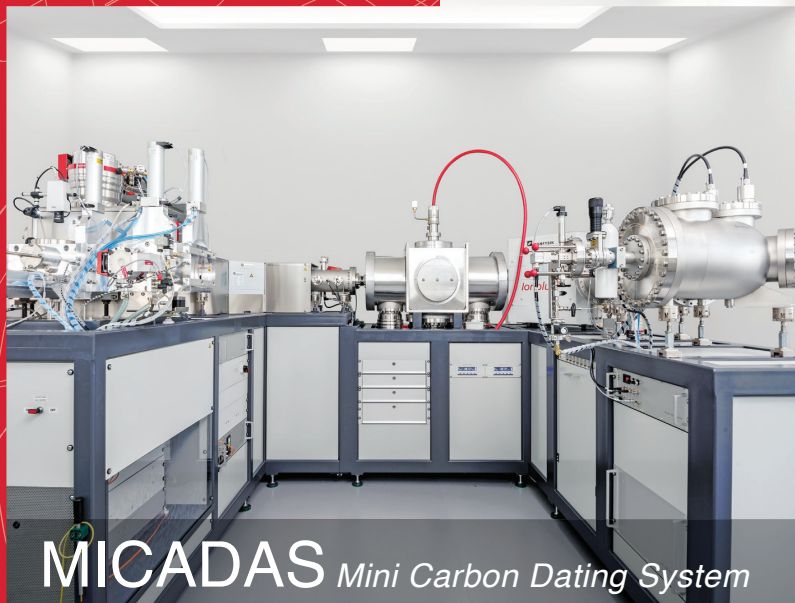
MICADAS Mini Carbon Dating System

Scientific Instruments for Radiocarbon Dating and Accelerator Mass Spectrometry