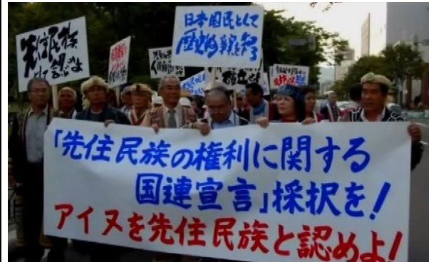
Demonstrators call for official recognition of the Ainu's rights as indigenous peoples.

But in these cases, Ainu policy as construed in terms of the constitution depends not upon clear stipulations found in the actual constitution itself, but rather on the interpretations of a handful of constitutional scholars. Moreover, Article 13 of the constitution clearly deals with the human rights of individuals (not of groups), and does so only to the extent that this "does not interfere with the public welfare". In other words, while the criteria of the United Nations Declaration on the Rights of Indigenous Peoples emphasizes the centrality of collective rights, Ainu policy falls at the exact opposite end of the spectrum: it is presented as a matter of the rights of individuals to "life, liberty, and the pursuit of happiness". Tsunemoto came to refer to this unique rights policy in 2010 as "Japanese-style Indigenous Peoples' Policy" 25 . Not surprisingly, this idea has become an extremely effective back-up for the Japanese government, particularly for central government bureaucrats who are reluctant to support group rights.