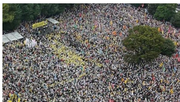
Tokyo Demo on the anniversary of 3.11 disaster