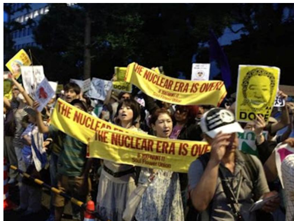
The Nuclear Era is Over if you want it

The main chant that I heard was 'No Restarts!' ( saikado hantai ) which people were shouting together in response to cheerleaders with megaphones and groups of drummers spaced out down the line. By around 7.30 it was deafening. Earlier, other slogans were shouted, usually to a drum beat, such as 'Give Back Fukushima!' ( fukushima kaese ), 'Noda Quit!' ( noda yamero ), and one I heard in English, 'Shame on TEPCO!'. There was also no shortage of flags, signs and banners of varying sizes and qualities, in Japanese, English, and both, all with messages against nuclear power, the restarts and the Noda administration. Many of these were home made and original, expressing the sentiments of those who created and carried them. Some also drove past in trucks decked out with banners. The atmosphere was that of a very well-behaved, yet very angry, carnival. It dispersed quickly and calmly at 8 p.m. as planned when the organizers called a halt.