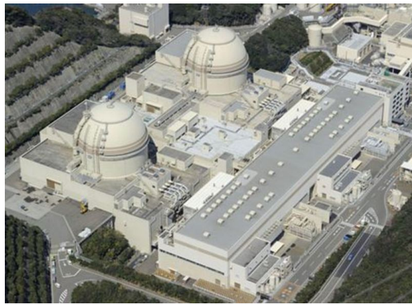
Buildings housing Oi reactors 3 and 4 in Kyodo photo in 2000

a 15% electricity shortfall in the summer. This gap could not be overcome through power saving and any power cuts that might arise would endanger people's lives and cause disruption. Stressing the continued importance of nuclear power, Noda announced that the government would produce a long-term energy plan in August.