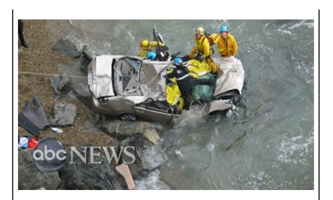
Reporting on Toyota acceleration crashes

Toyota is hardly the only car giant to experience these problems. General Motors recalled over three a half million cars in 2004. Defective windscreen wipers forced Honda to fix 3.7 million cars in 2005. Around the same time as Toyota was on the rack in its core US market, Ford discovered a problem with faulty cruise-control switches that ultimately triggered 14 million recalls – the largest in automotive history. The Japanese weeklies pointed out – correctly – that Ford had a far worse record for quality: another Ford recall in 1996 affected 7.9 million cars. But Toyota had built much of its reputation on keeping tight control over quality.