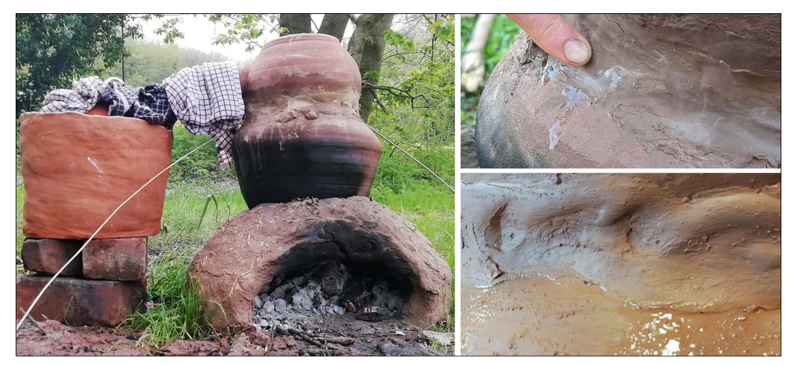
Figure 3. Complete experimental apparatus (left) and distillate leaking through a channel created at a contact point between the still body and head (right) (after Groat 2023: fig. 59).