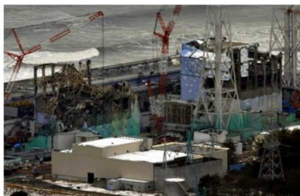
The face of sheer luck: Reactors 3 and 4 at Fukushima Daiichi

These spent fuel rods are supposed to be stored and reprocessed at the Rokkasho facility, but there have been significant delays and problems in completing this project and its capacity is insufficient anyway. 57 The storage pool at Rokkasho is already 95% full while the cooling pools at reactors are nearly full and all remain vulnerable to seismic events. There are no large dry-cask storage facilities in Japan for more secure, interim storage as is the case in Europe and the US. The US faces similar problems in dealing with nuclear waste disposal and has also not moved ahead with a permanent storage solution. At the end of February 2012 the Japan