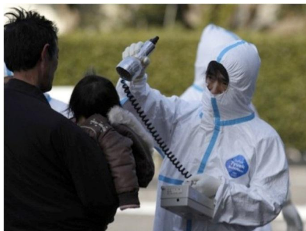
Checking for Radiation with dosimeter

Activists have sought a national referendum on nuclear energy and various local referenda are being mooted. The central government, however, will work to prevent public sentiment from dictating national energy policy. 52 The popular mayor of Osaka, Hashimoto Toru, has been very critical of the utilities and when he was governor of Osaka he spoke out against nuclear energy on which the Kansai region previously relied for 50% of its electricity. At present, the three major cities in the Kansai heartland—Osaka, Kyoto and Kobe—are lobbying KEPCO to phase out nuclear energy and disclose information about energy supply and demand, and lower rates. The three cities control nearly 13% of Kansai Electric shares (Osaka 9%, Kobe 3% and Kyoto 0.45%) and plan to table a motion on phasing out nuclear power at the June 2012 shareholders’ meeting.