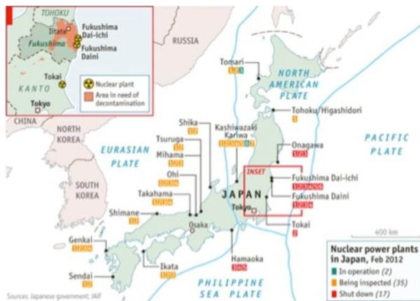
Status of Nuclear Power Plants, Feb 2012

It is important to learn lessons from the poor risk management in the nuclear industry because Japan will probably continue to rely on nuclear energy for years to come despite the Fukushima debacle. All but 2 of the nation's 54 reactors are currently idled, and all will be offline by May.