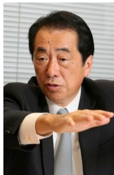
Scapegoat: Former Prime Minister Kan Naoto

At the end of February 2012 an investigation conducted by the non-governmental Rebuild Japan Initiative Foundation (RJIF) criticized Kan for micromanaging and meddling in the crisis response at the nuclear plant and for closeting himself with a small coterie of trusted advisors,