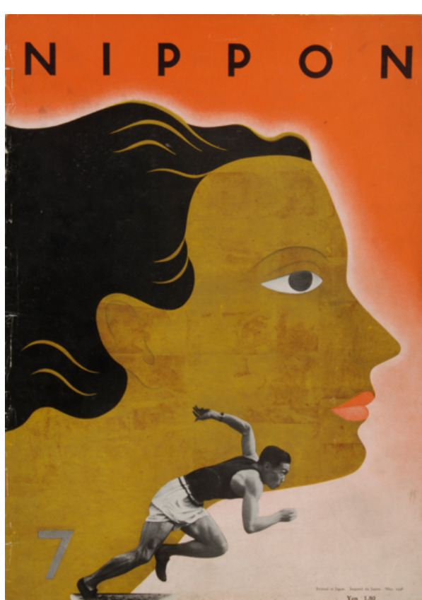
Figure 1. Takashi Kono, Issue 7 of Nippon magazine, 1936.