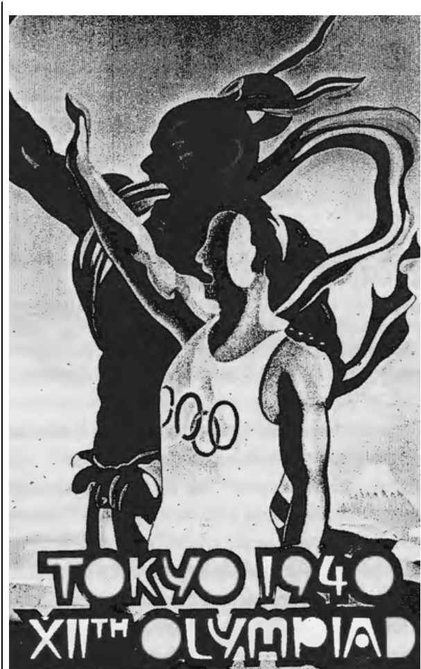
Figure 2. Wada Sanzo, Poster for the 1940 games.

Along with the Olympics, there was another important international event that was planned to take place in Japan that year: The Tokyo Exhibition. It was conceived as a World's Fair, and for this event as well, the state made significant investment. The Wolfsonian in Florida houses a few postcards that portray building plans designed for the occasion (Figure 3). Monumental buildings in these postcards, like the graphic designs for the Olympics, use a modernist visual language that prefers clean lines, geometric abstraction, and minimal decoration, which make the designed buildings resemble the architecture in other