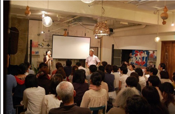
Kamanaka's citizen-led independent film screening.

must do." It's only from such conviction that real action begins, that everyone commits their abilities, their brain power, their power to act.