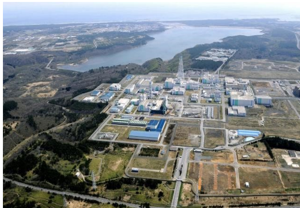
Rokkasho Reprocessing Plant