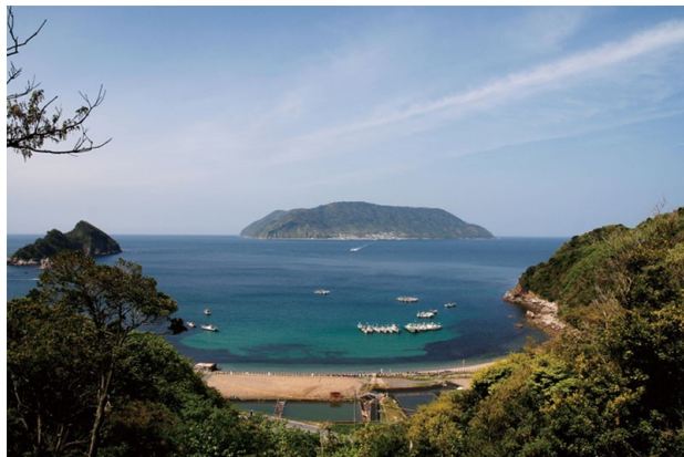
Iwaishima, the focal point of Ashes to Honey

What we see in Sweden and in the places I filmed for Ashes to Honey are not the actions of a centralized state but rather humble struggles on the part of people living in small towns and villages to bring about, on the strength of their own actions, a wholesale transformation in the way energy is produced and used. In point of fact the people of Iwaishima are up against centralized nuclear energy policies that rob them of their right to self-determination. Although whether or not to build a nuclear power plant is something that people who live there should be able to decide by themselves, they're left with no say in the matter whatsoever. So it's in places like this that the change must begin.