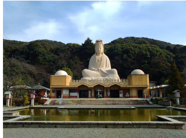
Figure 1: Ryōzen Kannon.

In addition to the Kannon statue, the grounds of Ryōzen Kannon contain several monuments and records significant to war memory in Japan and beyond. Firstly, it holds a register with the names of two million Japanese war dead. Behind the statue and main hall, which acts as a space for services and gatherings, sits the Reihaiden, a hall with 600,000 small Buddhist tablets ( ihai ) for Japanese and others who died in the Asia-Pacific War, including—as will be explored later—Koreans. Both the register and collection of ihai tablets are from the early years of Ryōzen Kannon. Adjacent to the Reihaiden is the Memorial Hall, which was built in 1959 to house a monument to the unknown soldier. 1 This also contains vessels of soil from war cemeteries around the world and cabinets containing records of the names and fate of tens of thousands of Allied POWs who died in Japanese captivity between 1941 and 1945.