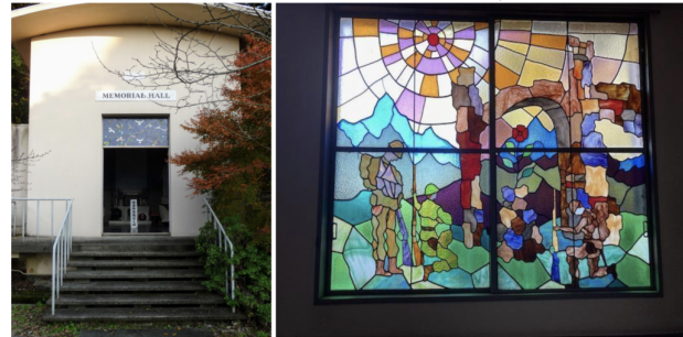
Figure 5 (left): Memorial Hall entrance (photo by David Moreton, 2017).

Memorial Hall was built to house it ( Kyoto Shimbun 11 November 1959, 11). The Memorial Hall is a church-like, light-filled space with its name written in English across the entrance (figure 5), and large stained-glass windows depicting such scenes as flying doves and the sun over soldiers kneeling in prayer (figures 4 and 6). Today, a Western-style female sculpture (signed “Amenomiya K,” it is likely the work of sculptor Amenomiya Keiko (1931–2019)), a photo of visiting veterans from Hawai’i, and other commemorative and memorial objects surround the 2.5-meter-high stone tablet.