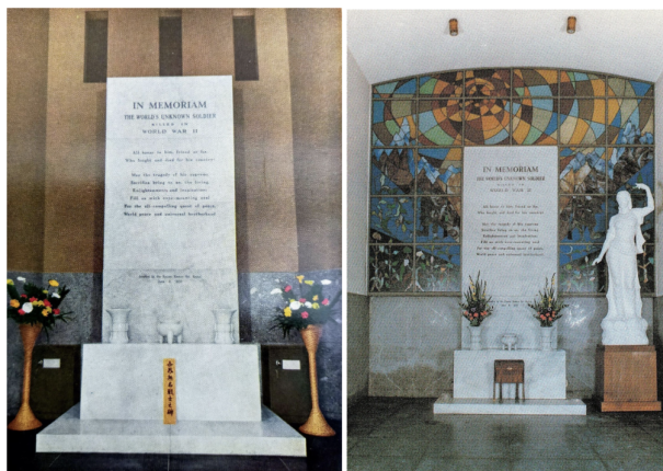
Figure 3 (left): The memorial tablet in its original location in a room under the Kannon statue (postcard likely from 1958–9.).