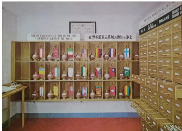
Figure 7: Memorial Hall annex with vessels of soil and cabinets holding POW cards (undated postcard, approximately from the 1960s. David Moreton collection).

nations—the “Eastern Bloc”—are entirely absent, while (South) Vietnam and Laos are represented as Western Bloc nations long beyond their transformation to Communist states in 1975.