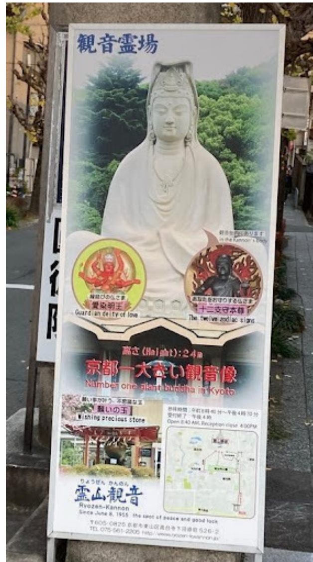
Figure 10: Street signage for Ryōzen Kannon at the road to Gokoku Shrine on Higashiōji street.