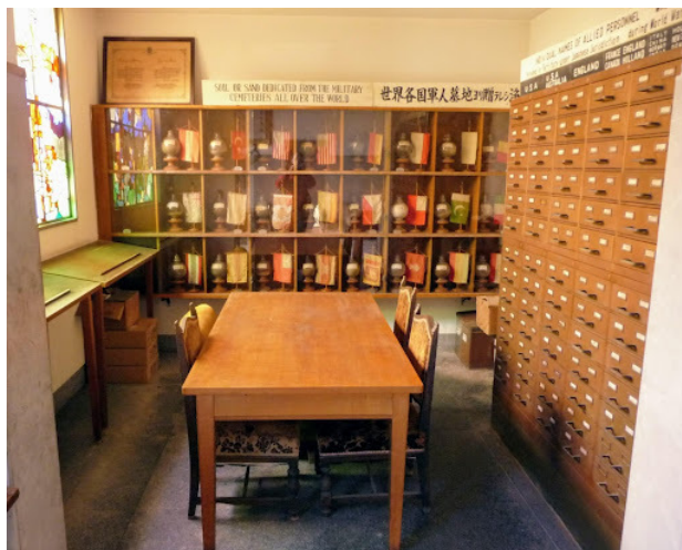
Figure 8: Memorial Hall annex today (photo by David Moreton, 2019).

Along the wall to the right of the vessels are large filing cabinets containing cards with information on 48,146 POWs who died or went missing under Japanese custody during the Second World War (figures 7 and 8). These provide information identifying and explaining the fate of each individual, and are divided into countries with—according to contemporary news reports ( Asahi Shimbun [evening edition] 5 June 1958)—the corresponding number of people: Australia (7,630), Belgium (1), Britain (18,117), Canada (282), China (204), Denmark (1), France (152), Holland (8,558), India and Pakistan (1,619), Italy (6), New Zealand (14), Norway (7), and the United States (11,555). The information on these cards was based on a register requested by the United Nations and compiled by the POW Information Bureau of the Japanese Army, which is now stored, but not openly accessible, at the Ministry of Health, Labor and Welfare ( Asahi Shimbun [evening edition] 31 July 2010).