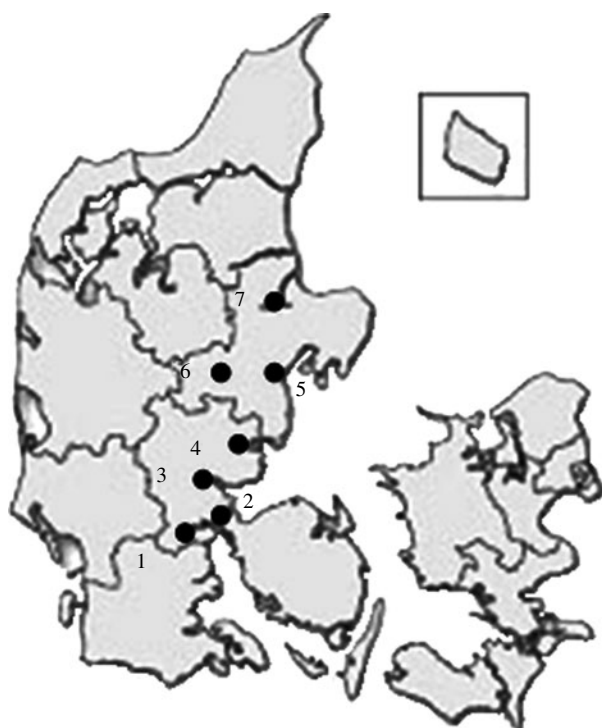
Fig. 1. Denmark, study towns. 1, Kolding; 2, Fredericia; 3, Vejle; 4, Horsens; 5, Aarhus; 6, Silkeborg; 7, Randers.

* The titres are based on the highest titre to any antigen in each case.