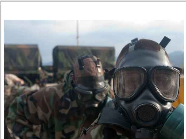
The 20th CBRNE Command (Chemical, Biological, Radiological, Nuclear, Explosives) is participating in Exercise Ulchi Freedom Guardian in South Korea, Aug. 17 - 28. 53

When the United States looks at Korea, it sees China.