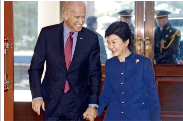
US Vice President Joe Biden clasps hands with President Park Geun-hye at the Blue House before Biden signs the visitor's book, Dec. 6. 40

So, in analysing world affairs the starting point must be the US. What does America want? That, needless to say, often bears little connection with what it proclaims as its objective. Analysis must be hard-nosed looking beyond the spin and rhetoric, focussing on actions and seeking real explanations. When we have some idea of America's position we can start looking at the other players, in descending order of importance. For most countries, most of the time, the United States is their major strategic partner-cum-adversary. They tend to tailor their policy in relation to third countries in the light of their political relationship with the United States. However for many countries, and South Korea is by no means alone, there is the dilemma of reconciling the economic importance of China with the relationship with the US. 39 At the same time we must presume that Washington has a global grand strategy (however incoherent and subject to various factions that may be) and that this strategy prioritises and subordinates the part to the whole.