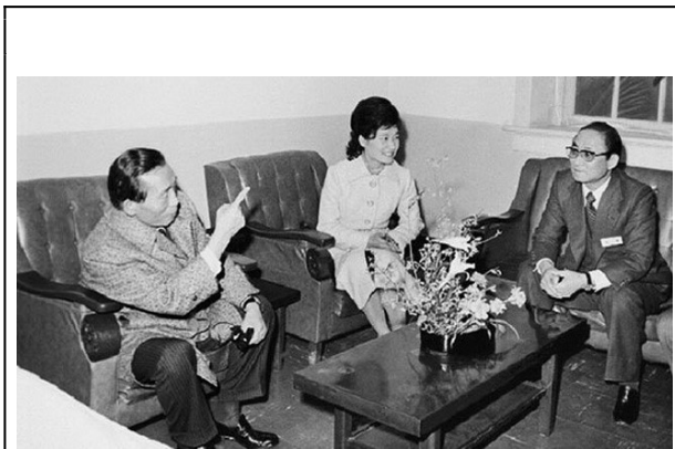
President Park Geun-hye, center, who served as first lady for her father President Park Chung-hee, left, after her mother was assassinated, speaks to Choi Tae-min, her mentor and the father of Choi Soon-sil, at a hospital owned by Guguk (save-the-nation) missionary group, set up by the senior Choi, in 1976.

Early revelations, with presumably more to come, on the role played by Choi Sun-sil (also transliterated Choi Soon-sil), Park Geun-hye's 'Shaman confidante' in influencing policy towards North Korea are shedding new light on this strange, rather dysfunctional administration. 106 Choi Sun-sil inherited her relationship with the Park family, father and daughter, from her father Choi Tae-min, who was labelled in State Department cable, Korea's Rasputin. 107