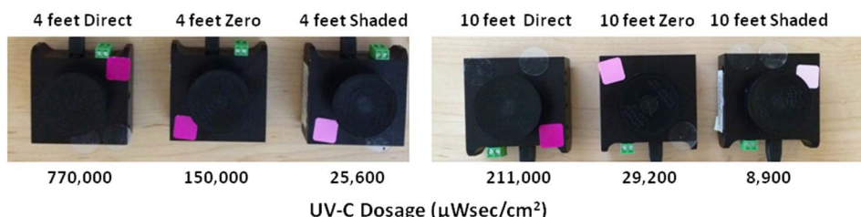
FIGURE 2. Results obtained with qualitative photochromic dosage indicator labels (red, pink, and white rectangles attached to sensors) and dosages ( \mu\text{Wsec}/\text{cm}^2 ) measured using radiometric ultraviolet C (UV-C) light sensors placed at various distances from and orientations relative to the UV device after a 15-minute cycle. UV-C light normally enters the radiometric sensors through openings that were covered by circular elevated caps at the time photographs were taken.

a Triplicate fixed-position readings were obtained in each room with 5-minute and 15-minute cycles.