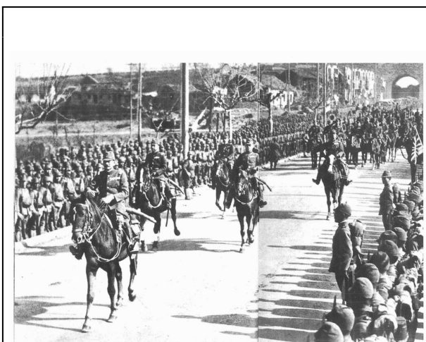
Japanese high command enters Nanjing on horseback

The next day they began shooting a documentary film, Nanjing [Nanking] that presents the battle as framed by the Japanese high command. The crew had just completed an earlier documentary, Shanghai, on the battle that paved the way for the advance of Japanese forces toward Nanjing. Dispatched to Nanjing without supplies, the reign of terror began en route with Japanese forces attacking villages en route to secure food and supplies. In Nanjing, shooting of the film continued to January 4, 1938 and the film was rushed to completion for release in Japan on January 20. (Can it also have been distributed for viewing in Chinese cities? Or for international distribution?) Long believed to have been lost, a print was discovered in Beijing in 1995, although with 10 minutes of the original missing. Nippon Eiga Shinsha made it available as a DVD. The present film superimposes primitive English translation . . . whether provided at the time of its release or years later, presumably for international distribution.