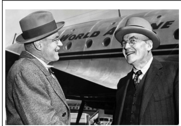
The Dulles Brothers (John Foster, right)

This same mentality also explains why Allen Dulles as an OSS officer in 1945 simply evaded orders from Washington forbidding him to negotiate with SS General Karl Wolff about a conditional surrender of German forces in Italy – an important breach of Roosevelt’s agreement with Stalin at Yalta for unconditional surrender, a breach that is regarded by many as helping lead to the Cold War. 22