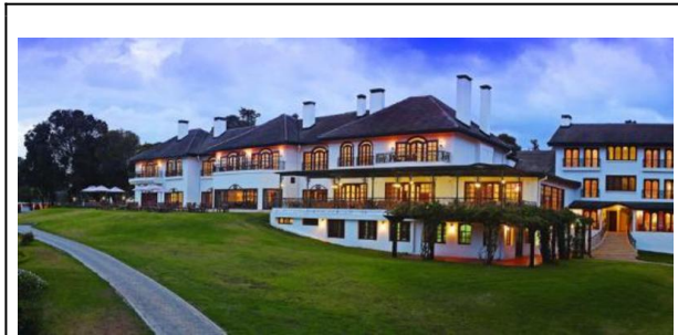
The Safari Club

CIA's retrenchment in the wake of President Carter's election and Senator Church's post-Watergate reforms. 35