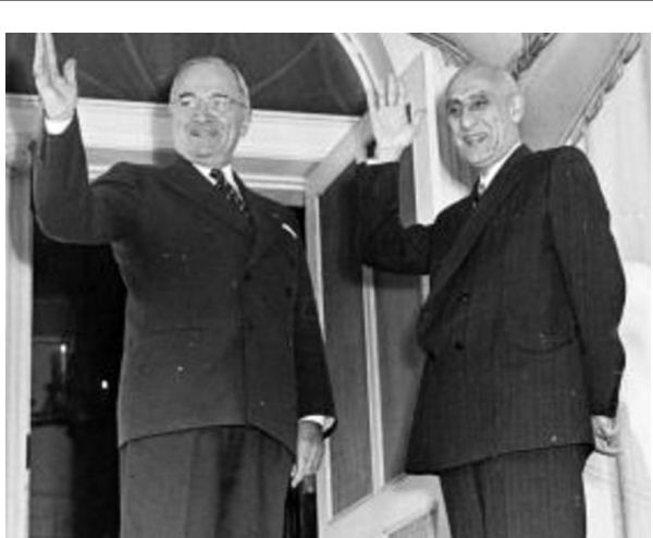
Truman and Mossadeq (right)

This shows how the deep state and its overworld are, and to some degree always have been, supranational. In the 1950s, for example, if Allen Dulles as CIA Director wanted to fly a U-2 over Russia on a certain day, and Eisenhower said no, Dulles would simply turn to his British counterparts in MI6 to get permission from Macmillan, and Dulles would get his way. 23