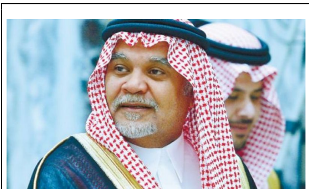
Prince Bandar bin Sultan, Also Known as "Bandar Bush."

The Vatican contribution, "for the CIA's long-time clients, the Christian Democratic Party," of course continued a CIA tradition dating back to 1948.