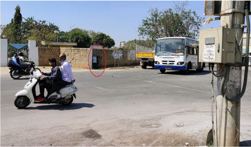
Figure 2. Older adults seeking shelter while waiting for a public bus.