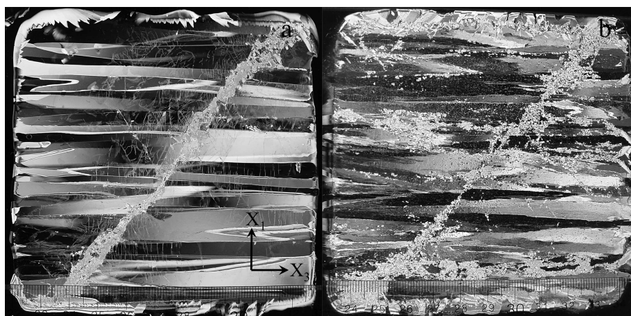
Fig. 1. Photographs of a P-fault in thin sections of (a) columnar freshwater ice and (b) columnar saltwater ice as viewed under polarized illumination. Faulting generated under (1.0:R_{21}:R_{31})=(1.0:0.5:0.2) at T=-20^{\circ}\text{C} at \dot{\epsilon}_{11}=1\times 10^{-1}\text{s}^{-1} . Minimum feature size on scale is 1 mm.

larger for saltwater ice ( B=9.8\times 10^{-7}\text{MPa}^{-n}\text{s}^{-1} ) than for freshwater ice ( B=3.5\times 10^{-8}\text{MPa}^{-n}\text{s}^{-1} ).