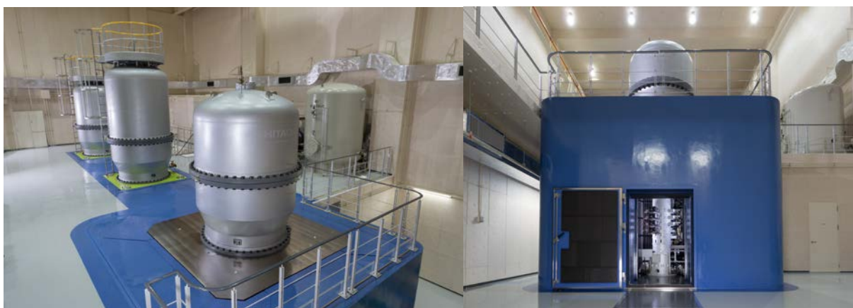
Figure 1. Aberration corrected 1.2-MV cold field-emission transmission electron microscope.