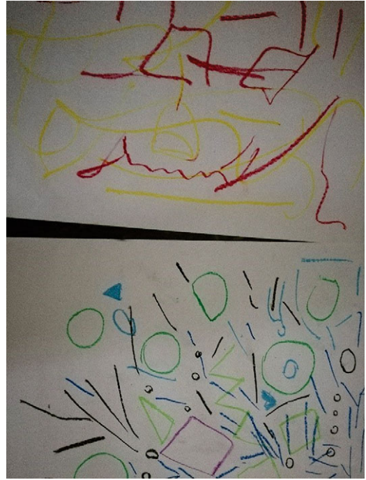
Figure 3. Drawings by the actors playing Irina.

drawings, but, ultimately, they are simply outcomes of an exploration. What is potentially worth noting, however, is the fact that, although the actors are from different cultural and linguistic backgrounds, each personally unique and drawing on different days, their drawings have common elements.