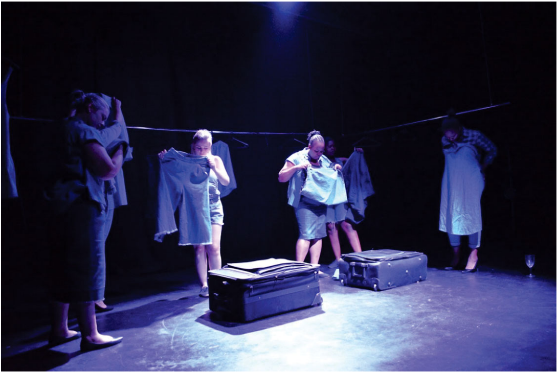
Figure 4. The actors packing clothes, in performance at the POPArt Theatre, Johannesburg.