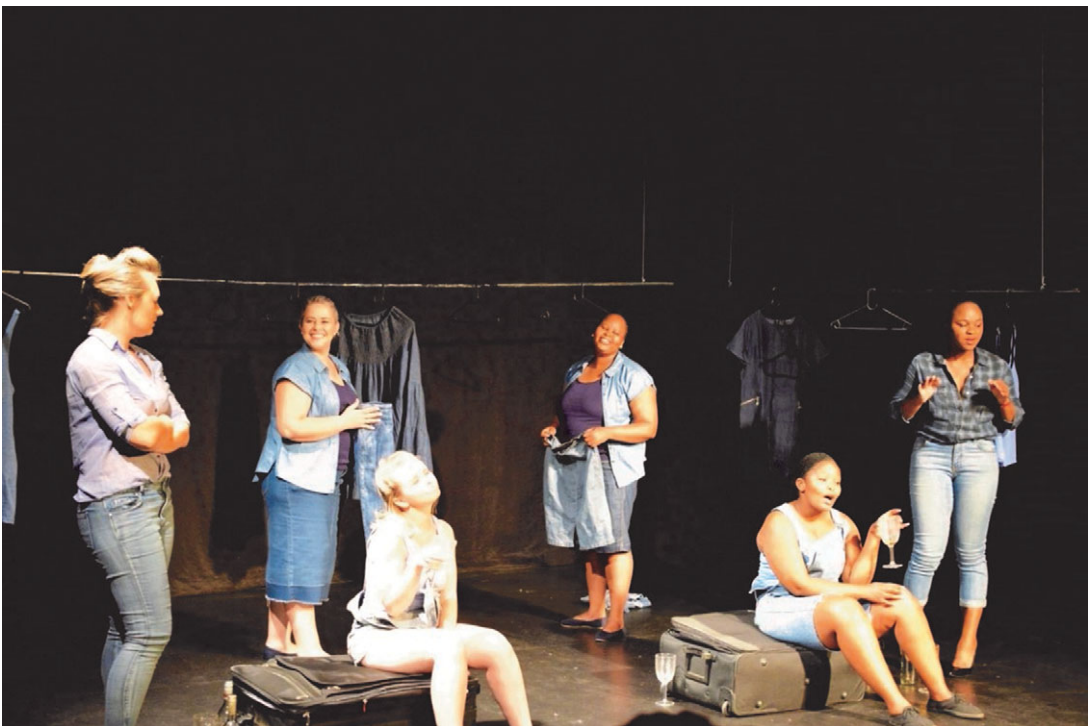
Figure 5. The full cast in performance at the POPArt Theatre, Johannesburg.