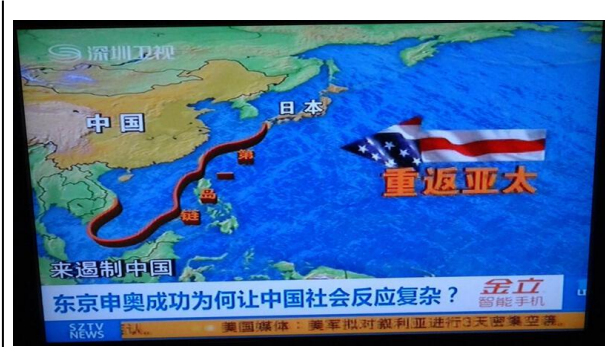
Fig. 3: Chinese perception of the US Pivot to the Asia-Pacific and 'First Island Chain' as its primary defense perimeter (Screenshot by the author, Beijing, 2013)

The danger produced from this antagonistic interaction reinscribed the boundary between 'East' and 'West' along the former perimeter of defence against the Communist Threat, originally drawn by former U.S. Secretary of State Dean Acheson in January 1950. 12 Hence, the Korean Peninsula, the East China Sea, Taiwan - and the South China Sea - continue to be contested frontiers in the ostensible civilizational struggle. This bordering effect became visible in the way the Obama administration implemented its pivot to the Asia-Pacific, and in how it was perceived by the leadership in Beijing (Fig. 3).