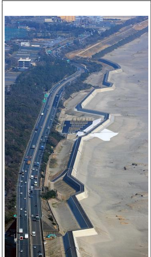
Fig. 1: Breakwater along the coastline in Hamamatsu, Shizuoka Prefecture, Japan

ecological sustainability that are crucial for future prosperity.