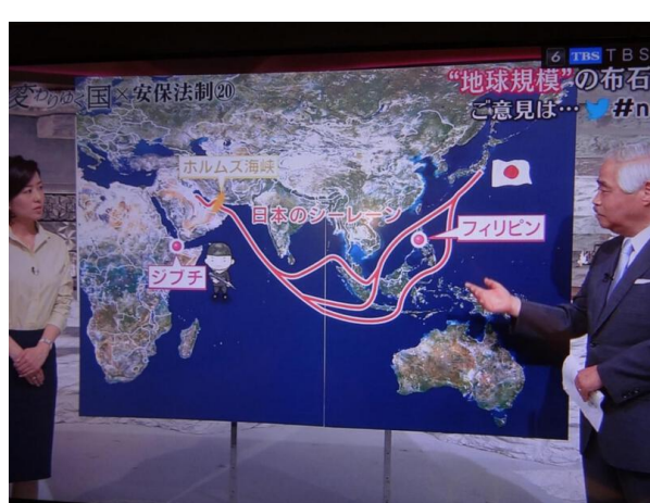
Fig. 4: The portrayal of SLOC as vital for Japan’s national security in debates about legislative and constitutional change for allowing overseas military deployments.

On the one hand, China’s economic catching up shifted and challenged the cognitive boundaries that had long differentiated the developed ‘West’ from the developing ‘East’. Established actors’ resistance to this reordering of the mental map accentuated bordering practices that aimed at reinscribing the ‘East’-‘West’ division. This, in turn, strengthened the Chinese leadership’s resolve to accelerate the ‘rejuvenation’ of the country, such as through the proclamation of the Belt and Road Initiative (BRI) in 2013. It also triggered the decision to embark on massive land reclamation in the Spratlys with the aim of creating a military buffer zone in the South China Sea. On the other hand, the US and especially its Australian and Japanese allies, worried about Chinese moves and, anxious about declining US power, reached out to new partners. To India in particular. Various initiatives for militarily securing ‘freedom’ and ‘openness’ across the ‘Indo-Pacific’ emerged. Following, countering, and mirroring the BRI,