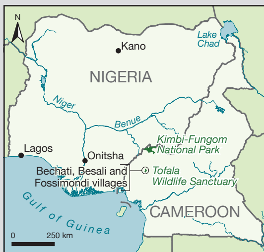
FIGURE 2.1 Cameroon and Nigeria