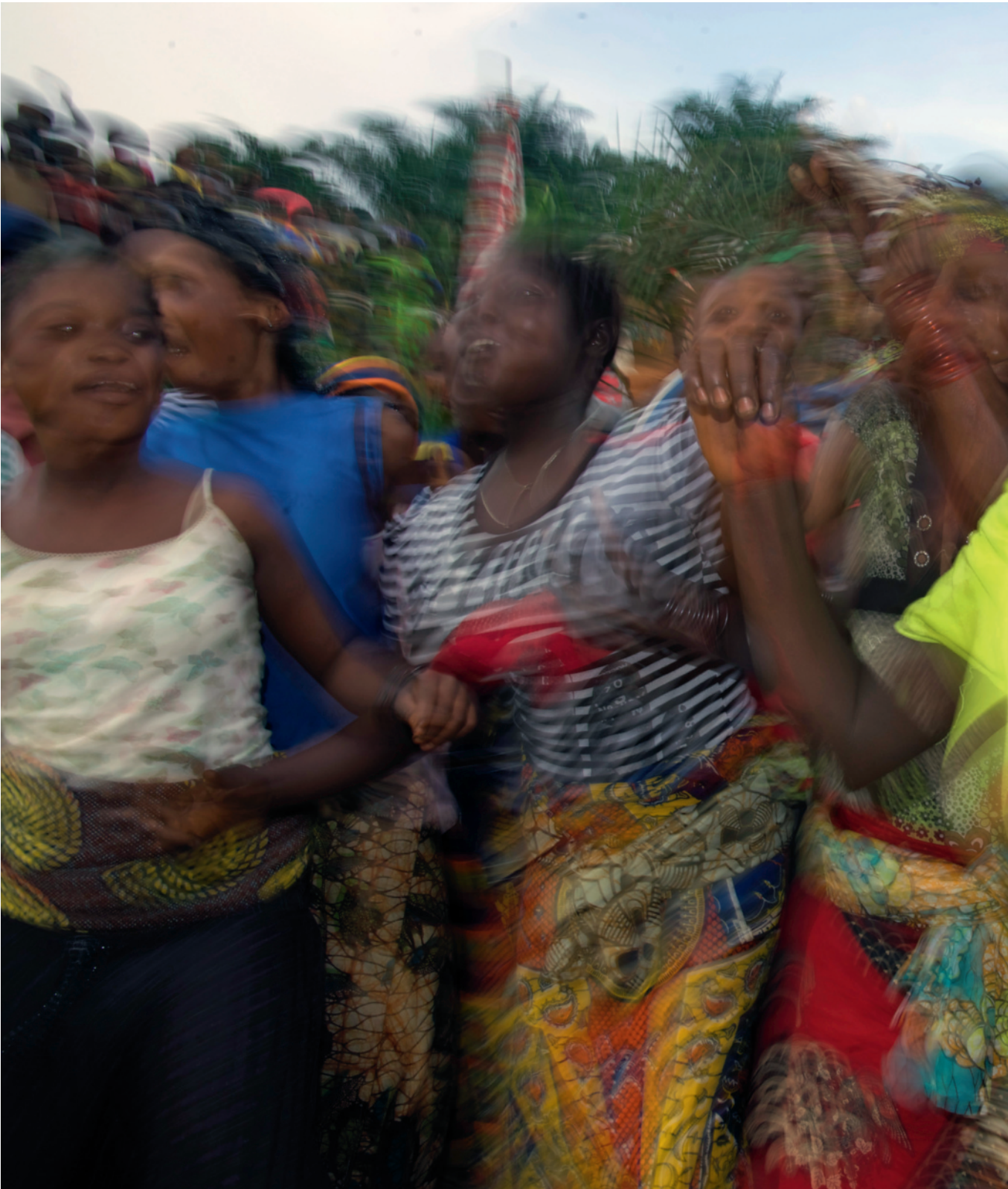
Photo: Ethnographic and other social science research techniques can provide insights that complement traditional conservation programming.