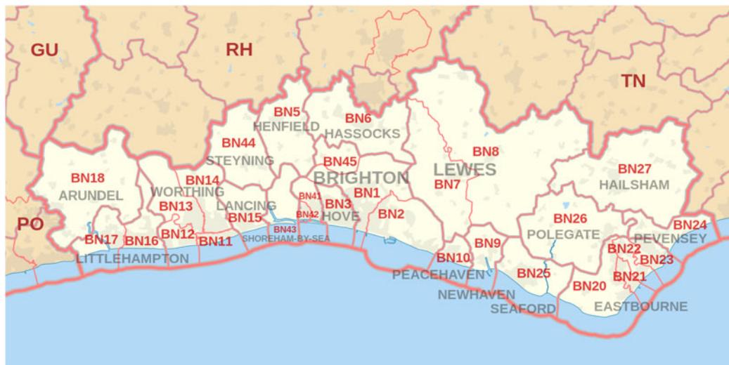
Figure 1. The post code areas of Sussex, Creative commons BN postcode area map by Richardguk is licensed under CC-BY-SA-3.0 (© Ordnance Survey 2012)

what we find in the EDA results. We will come back to this point in the discussion.