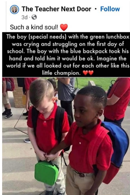
Figure 1. The Teacher Next Door, “Such a kind soul!” Facebook, May 5, 2024, https://www.facebook.com/search/top/?q=the%20teacher%20next%20door%20such%20a%20kind%20soul! .

looked out for each other like this little champion” reframes imagination as the possibility of human connection, not as a game de-centering the one experiencing the disruption. Figure 2 follows this same demonstration of empathy when an observant flight attendant, responding to a distressed passenger, “explained every sound and bump and even sat ... holding her hand when it still got to be too much for her.” These two individuals respond to a circumstance wherein their perceptive observations of others in distress do not lead with the fundamental impossibility and faulty emotional and spiritual prerequisite of “I know how you feel.”