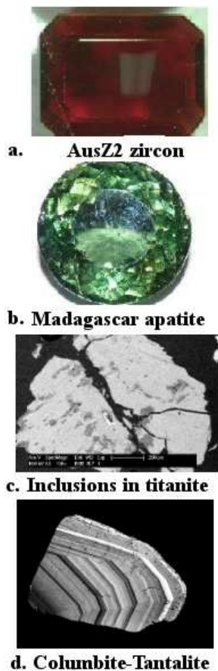
FIG. 1 Images of RM.