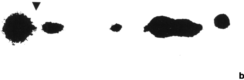
Figure : (a) 10 mn UV exposure of the M87 jet (b) 30 mn UV exposure after an image treatment showing the small inner jet (arrow).