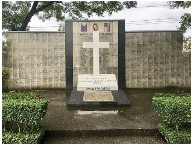
Figure 7: “Omnia Pro Patria in Capas National Shrine, a cross dedicated to fallen American soldiers in Bataan during Japanese occupation.”