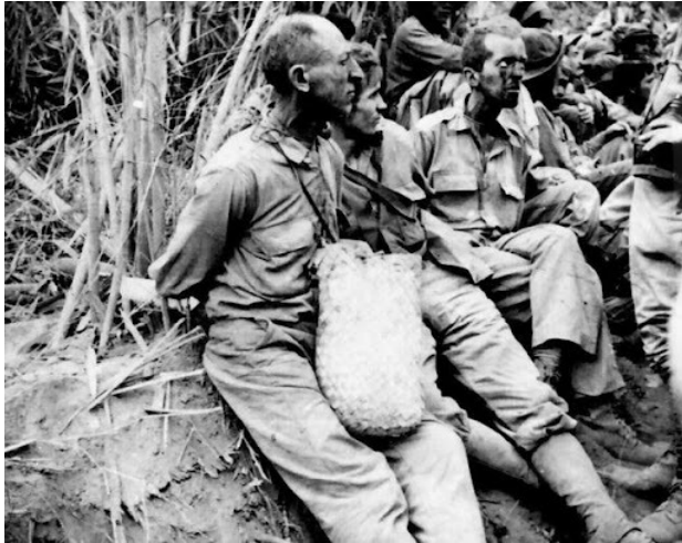
Figure 3: “Photograph of Prisoners Along the Bataan Death March.”