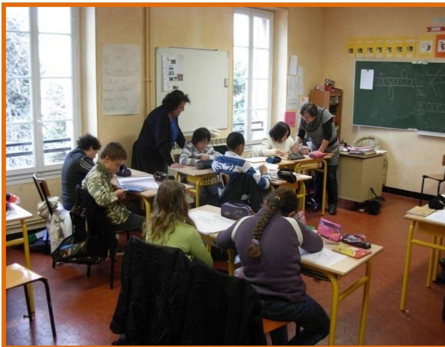
Figure 2. 10 young people with learning disabilities in a specialised class at College Sévigné in Marseille do their Greek.