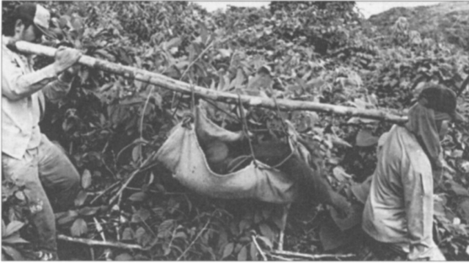
An immobilized animal is carried out of the jungle to an awaiting vehicle.

heavier metal darts are liable to inflict injury on a mammal the size of an orang-utan should a shot have too much power for the distance. A 19- or 20-mm needle, with a retaining collar, was found to be optimal in both systems.