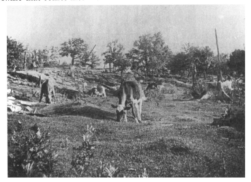
Photo 1. On the frontiers in North America and the Antipodes, settlers of the British diaspora grazed their animals on partly cleared but unfenced land, as shown in this photograph of such a range in Muskoga, Ontario about 1910.

ing cattle out onto the owner of the animals ("herd" law); New Englanders and most other colonists, favoring animal husbandry in the first stages of settlement, returned the burden of fencing cattle out onto the cultivator.<sup>2</sup> The destructive pig was treated differently. Pigs were allowed to fodder on the waste and commons ("the woods" in America; the "bush" in the Antipodes) but were to be yoked or ringed, and as early as 1633 a Massachusetts ordinance stipulated that "it shalbe lawfull for any man to kill any swine that comes into his corne."<sup>3</sup>