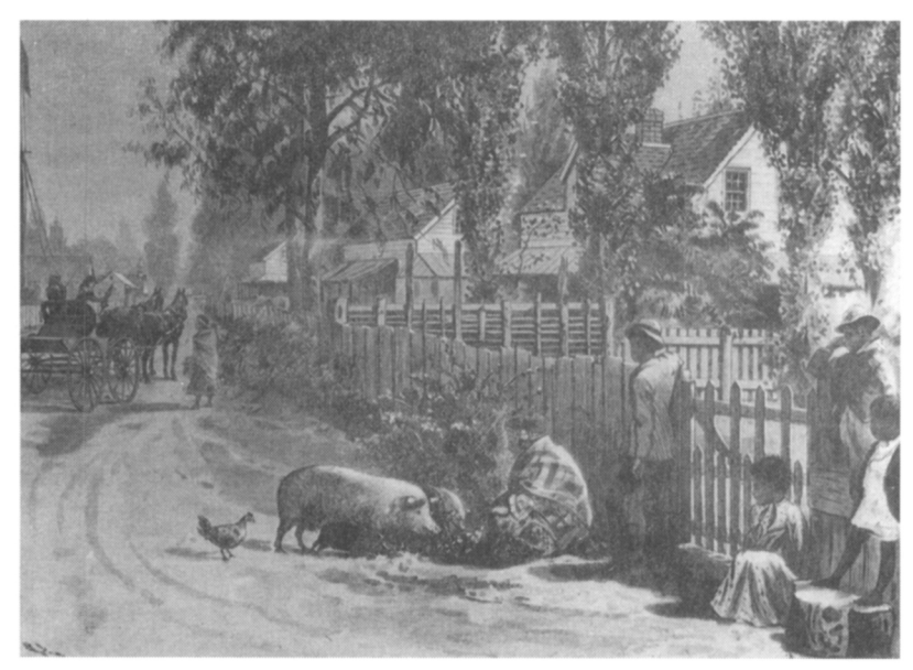
Photo 5