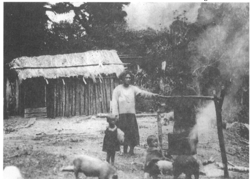
Photo 6