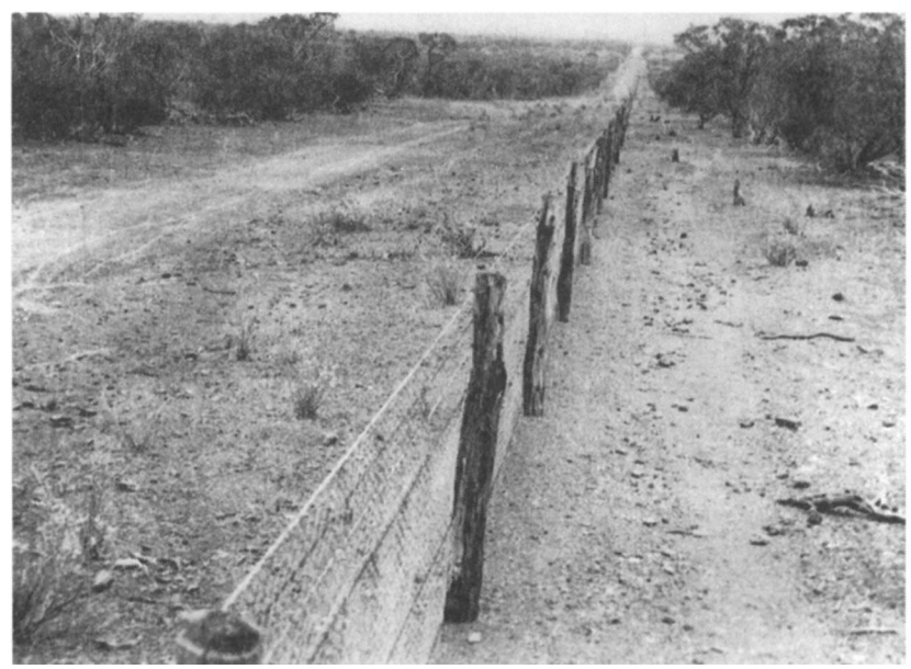
Photo 4. In Australia and New Zealand, fencing was needed to keep rabbits out of the pastures. The above photograph shows a rabbit-proof fence in Western Australia. (Rabbit Proof Fence no. 1, Western Australia, 1926. The long road looking south. Photograph by Mr. F.H. Broomhall in the Pictorial Collection, National Library of Australia)

kill another mule or burn the hut again, to share with me the cost of replacing it, as mules & huts cost money."9