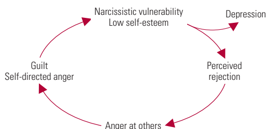
FIG 1 Vicious cycles in depression: narcissistic vulnerability and anger.

Employing theoretical, clinical and research perspectives, Rudden et al (2003) and Busch et al (2004) developed a core psychodynamic formulation for depression. Individuals prone to depression are viewed as having a high level of sensitivity to loss or rejection, broadly referred to as narcissistic vulnerability. The sensitivity develops in the context of early life experiences involving feelings of disappointment and helplessness, which become interpreted as signs of inadequacy, unlovability or