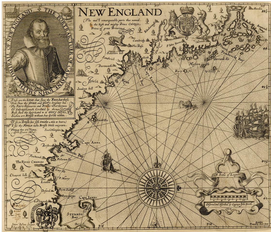
FIGURE 2. John Smith, New England: The most remarkable parts thus named by the high and mighty Prince Charles, prince of great Britaine, London, 1617