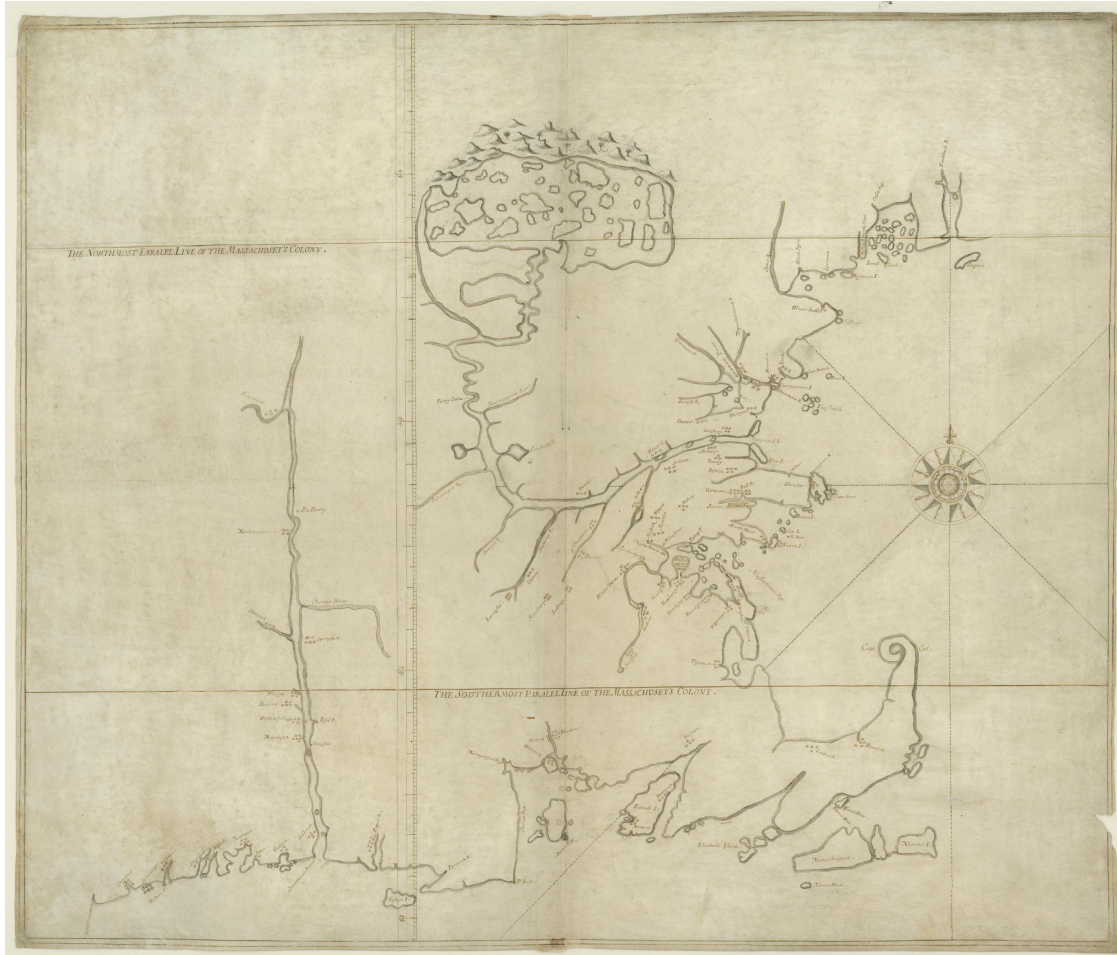
FIGURE 3. Unknown Author, New England , showing Massachusetts' boundaries, London, 1678

Note: Copy of an original manuscript, New England, c. 1665. The title and place of origin are attributed by scholars.