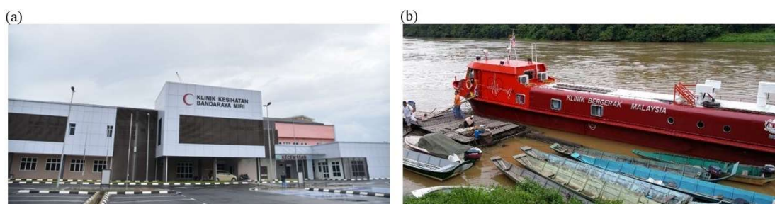
Figure 4: (a) Government clinics in Malaysia [32]. (b) Riverine mobile clinic for remote areas [33].

Malaysia has one government clinic every five square kilometres. Most of the population lives within that radius (as shown in Figure 4a), facilitating parents to get free immunization easily for their children [12]. Some vaccines are also delivered through the school health service programme via a mobile team [14]. Apart from collaborating with the Ministry of Education, the MOH also works closely with the Department of Orang Asli (Indigenous) Development and non-governmental organisations to provide immunization to marginalized groups. In Malaysia, many Orang Asli live in rural areas or deep in the jungles. To ensure they are not left behind due to geographical barriers, the MOH provides health services via a flying doctor team to remote areas. The MOH is also committed to ensure vaccine access by providing riverine (as shown in Figure 4b) and sea mobile clinics for communities in the remote areas of Sabah and Sarawak. From time to time, the MOH will also conduct supplementary immunization activity by visiting the homes of those who miss out on their vaccinations [12].