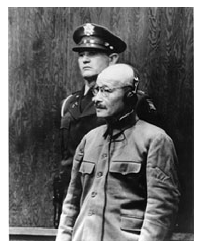
Tojo Hideki awaits sentencing, Movember 24, 1948.

The Home Affairs Ministry compiled a report on popular reactions from each region, but recorded the overall situation as follows: "Regarding General Tojo's decision to commit suicide, those completely sympathetic to the timing, method, and attitude shown in the suicide are exceedingly rare, and most people are thoroughly critical and reproving. The main reactions are as follows: