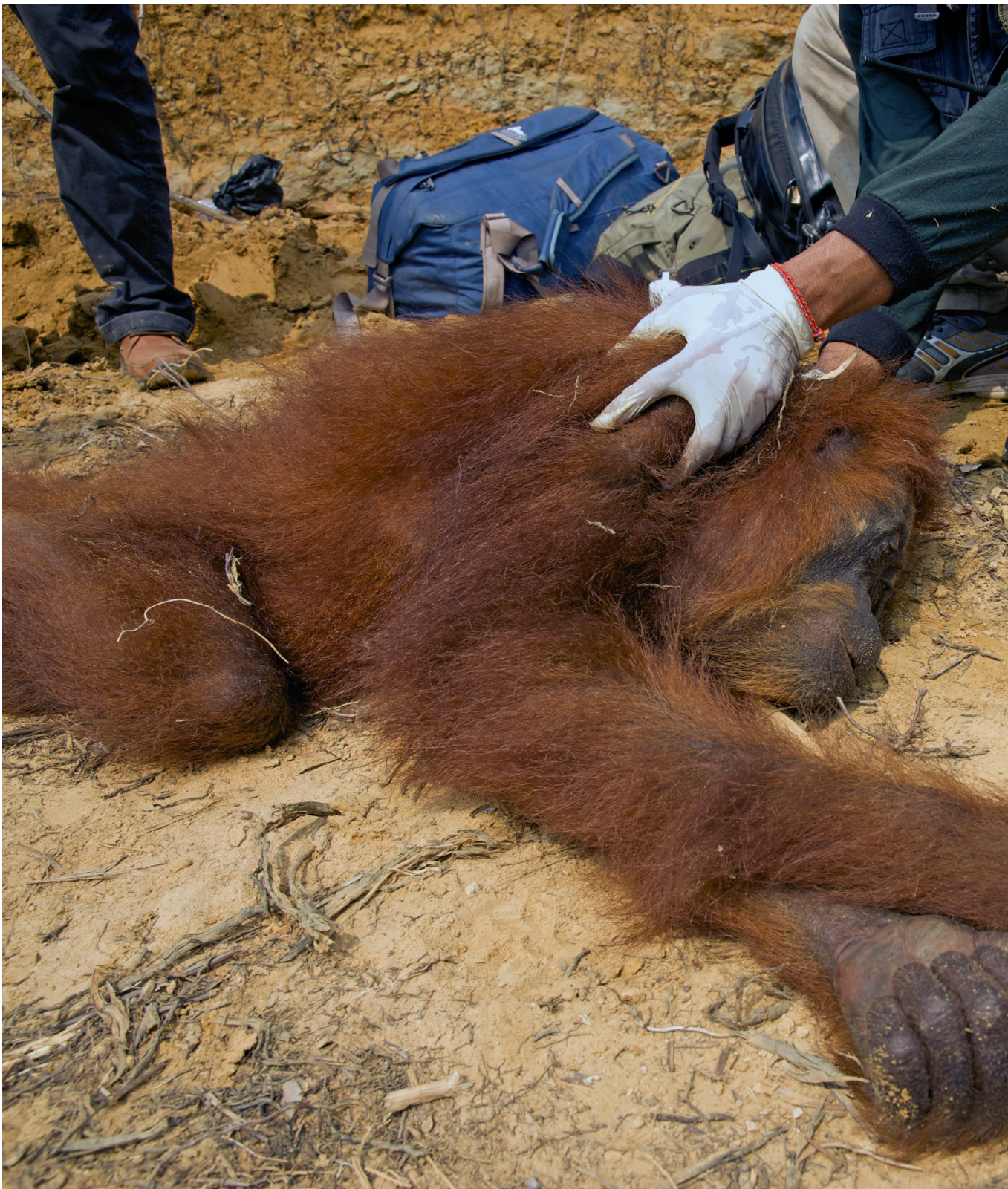
Photo: Natural and anthropogenic hazards imperil the survival of apes, especially if multiple threats affect already reduced and fragmented ape populations.