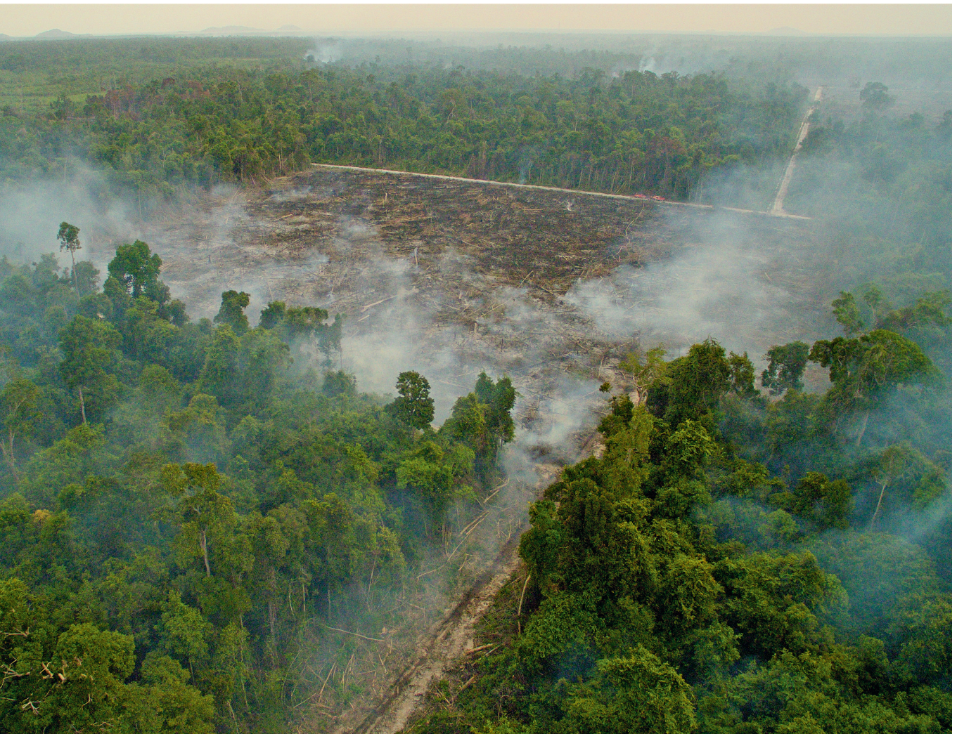
Photo: When hazards such as forest fires destroy habitat, for instance, apes' access to food and shelter drops significantly faster, causing declines in birth rates and population numbers. Freshly cleared patch of forest that has been burned for agriculture, Gunung Palung National Park, West Kalimantan, Indonesia.