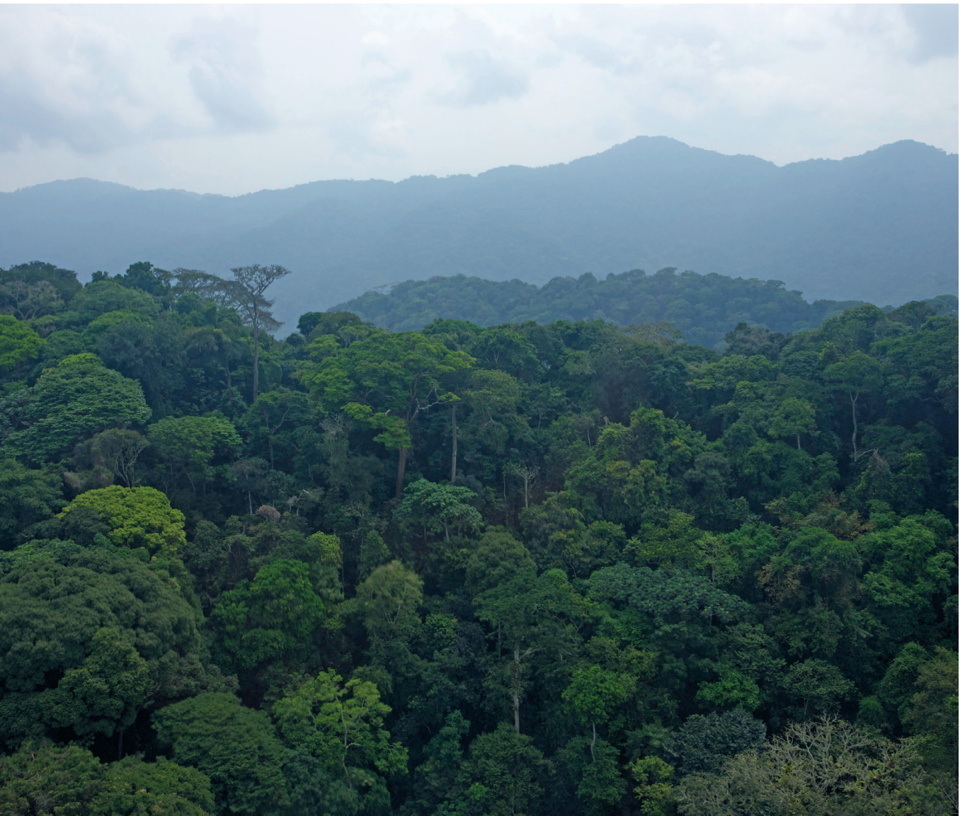
Photo: The long-standing practice of creating conservation areas is aimed at reducing the likelihood of impact from anthropogenic hazards such as forest fires, industrial incidents, dam failures, landslides associated with construction, and conflict situations.

and ability to meet the needs of apes can also influence the impacts of natural hazard, such as hurricanes, typhoons, lightning-caused forest fires, flooding and earthquakes. The larger the conservation area, the lower is the likelihood that a single hazard would be able to impact the entire area and its ape populations. As noted above, larger areas offer more opportunities to find scarce foods and shelter in and around a hazard-affected landscape (Behie et al. , 2019).