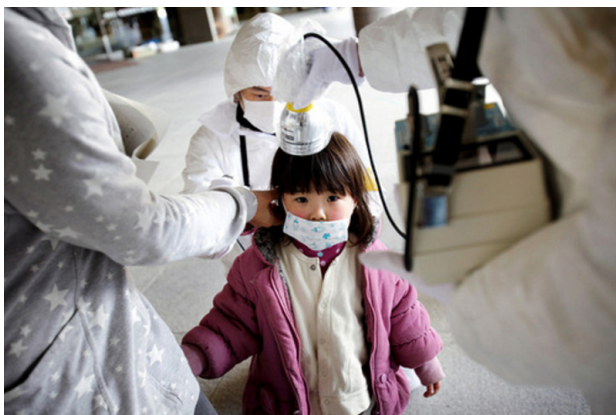
US doctor examines a young Rongelapese affected by Bravo radiation