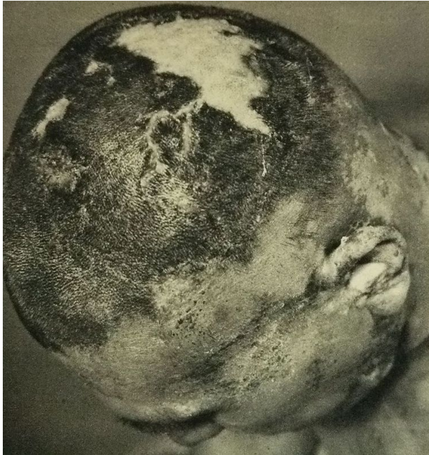
A child from Rongelap showing health effects from radiation exposure after Bravo