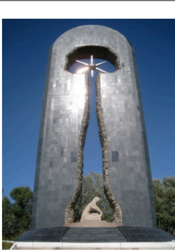
The memorial "Stronger than Death" in Semey, Kazakhstan

Conclusion —Radiation makes people invisible. It makes them second class citizens who no longer have the expectation of being treated with dignity by their government, by those overseeing nuclear facilities near them, by the military and nuclear industry engaged in practices that expose people to radiation, and often by their new neighbors when they become refugees. People exposed to radiation often lose their homes, at times permanently, either through forced removal or through contamination that makes living in them dangerous. They lose their livelihoods, their diets, their communities, and their traditions. They can lose the knowledge base that connects them to their land and insures their wellbeing.