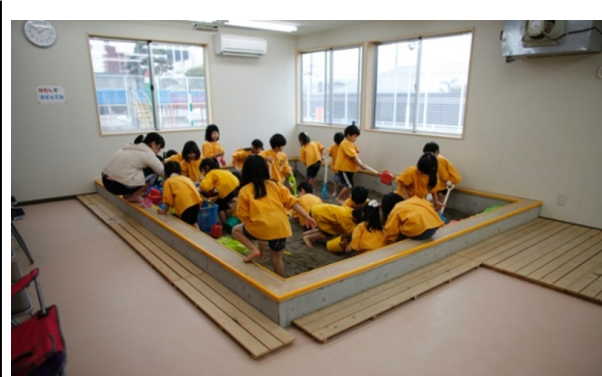
Fukushima school children play in an indoor sandbox

In Fukushima Prefecture the Japanese government proclaimed a 20km mandatory evacuation zone, while also designating a "suggested" evacuation zone from 20km to 30km. These zones do not directly reflect the dangers from radiation levels. In some of the mandatory evacuation areas the gamma levels are below those in parts of the suggested evacuation areas. Some areas where the plumes came down 50-80km away have even higher levels. The limits to mandatory evacuation areas reflect efforts to limit the direct liability of the government. Even today children live in areas where the radiation levels are too high for them to be allowed to play or spend significant time outdoors. 5