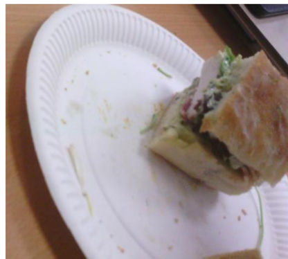
Fig. 3. Example of food images captured by the Narrative Clip.

However, two participants (10 %) stated that the camera made them more conscious of what they ate and that they tended to snack less when wearing the camera. They also noted that they were conscious that everyone could see the device if they were in a public location. While the majority ( n 13, 65 %) of participants felt that the camera did not invade their privacy, some ( n 7, 35 %) highlighted that use of the camera while using the bathroom and also in public situations was invasive. Nine participants also stated that they were conscious of the wearable camera throughout the day, especially in terms of whether the camera was positioned correctly to capture all food intake. Two participants also reported that the camera moved throughout the day or physically fell off their clothes. When viewing the images, the researcher also noted that some images were obstructed, for example due to hair, clothing and movement.