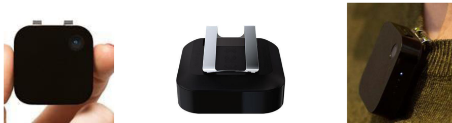
Fig. 1. Visual image of the Narrative Clip (30) .

for viewing. While the images were being uploaded, a 24-h recall interview was conducted with the participant. The 24-h recall consisted of three steps: Step (1) an initial quick list of everything the participant had eaten throughout the day, followed by Step (2) a more in-depth review of food consumption including: type of food eaten, location of where the food was consumed, amount of food, cooking methods used to prepare the food and whether the food was eaten alone or with other people. To improve accuracy, participants were shown photographs of different portion sizes to assist in quantifying the amount of food eaten (31) , Step (3) was a final review of food items and amounts recalled.