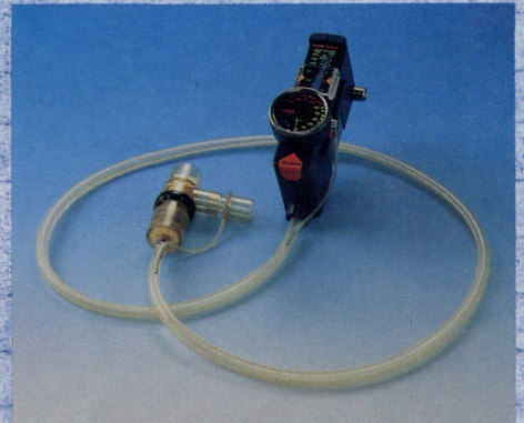
The Ambu® Matic Resuscitator