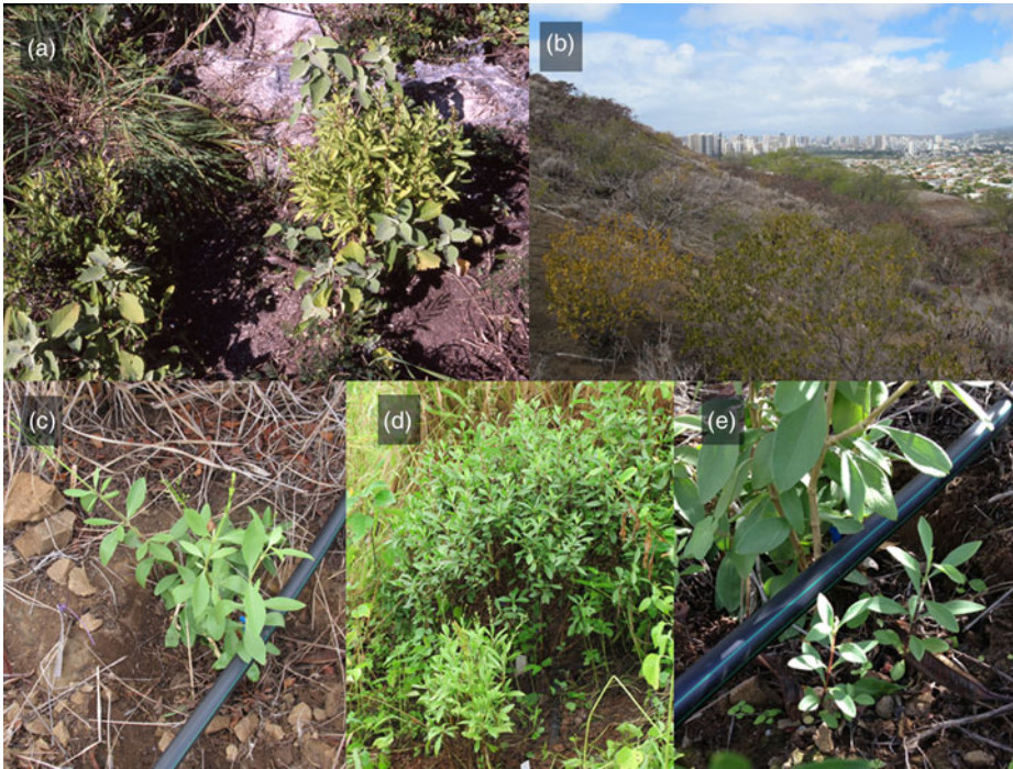
PLATE 1 (a) A portion of the natural population of Schiedea adamantis on Lē'ahi, on the Hawaiian island of O'ahu (Fig. 2), in 1994, with two large individuals in the right and left centre; other native species visible include Sida fallax , Eragrostis variabilis and Euphorbia celastroides , and the introduced species Leucaena leucocephala is visible in the lower centre and right. (b) The site of the 2012 reintroduction of S. adamantis on Lē'ahi, with the Wai'anae Mountains visible in the distance. Shrubs with yellowing leaves in foreground are the indigenous Dodonaea viscosa . (c) A recently planted individual of S. adamantis adjacent to an irrigation line. (d) Two individuals of S. adamantis 1 year after they were outplanted on Lē'ahi. (e) An adult individual and two seedlings of S. adamantis c. 3 months after initiation of the 2012 reintroduction. Seeds were planted at the base of the adult plant, in an irrigated area.

(Fig. 2) were also chosen for additional outplanting of seeds. Approximately 100 seeds per cross were planted at each of the numerous planting sites within each restoration area and marked with a numbered aluminium tag in December 1997 at all sites, and again at each planting site in February and December 1998 at the cleared and un-cleared reintroduction areas near the natural population on the rim of Lē'ahi. Crosses were allocated haphazardly at the planting sites, although an attempt was made to represent each cross as evenly as possible among the various planting sites. The rim areas close to the natural population on Lē'ahi and one of the Koko Crater areas were supplied with drip or microjet irrigation. Drip irrigation at Lē'ahi was supplied twice per week from December 1997, when the seeds were planted, until April 1998. Water was trucked to a portable tank located on the rim. At Koko Crater irrigation via the city water supply was carried out every other day for several months, and then as needed.