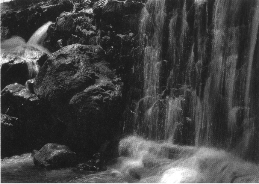
Figure 3 The Batateira River in Crato, which figures in numerous pilgrims' stories.

stone tomb in which the soldiers have encased the body. Her evocation of a world that spurns clear divisions between the human and nonhuman is likely to startle persons accustomed to the standard New Testament version of the story. From her perspective, stones that a geologist would see as inert are actually another life-form. Waterfalls are similarly alive and mobile (figure 3); just before the rainy season, one sings out right beneath her door.