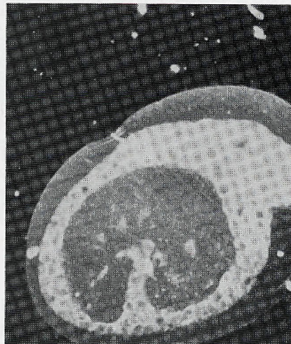
Figure 1: 3D reconstruction of fluorescent confocal image of a moth egg ( Apoda biguttata ).

Ms. Foster heads a consortium of microscopy experts who specialize in customized, on-site courses in all areas of microscopy, image analysis, and sample preparation. She is also the author of the recently released Optimizing Light Microscopy for Biological and Clinical Laboratories . To learn more about her company and the book, visit their website: MME-Microscopy.com/education .