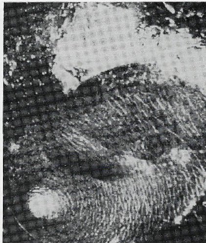
Figure 2: 3D reconstruction of the same egg, imaged using reflected light confocal microscopy.

Sample: courtesy of Dr. Marc Epstein (located at the Smithsonian Institute at the time these images were collected).