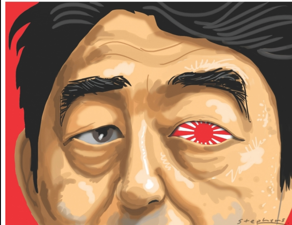
A January 2014 Chinese cartoon response to Prime Minister Abe's visit to Yasukuni Shrine

The escalating Sino-Japanese clash over history issues unfolded in often jarringly tandem steps. Conclusion of a formal peace treaty between Japan and the PRC in 1978, for example, coincided with the secret enshrinement of fourteen Japanese convicted of Class A war crimes in Yasukuni Shrine, which honors the souls of those who fought on behalf of the emperor; they were entered in the shrine's register as "martyrs of Shōwa" ( Shōwa junnansha ). Visits to Yasukuni by politicians first precipitated intense domestic as well as international controversy when Prime Minister Nakasone Yasuhiro and members of his cabinet visited the shrine in an official capacity on the fortieth anniversary of the end of the war in 1985-which, as it happened, was the same year the Nanjing Massacre Memorial Hall opened in China. As time passed, Chinese fixation on Japan's wartime aggression and atrocities grew exponentially at every level of expression, from museums to mass media to street protests-while conservative and right-wing denials of war crimes grew apace in Japan.