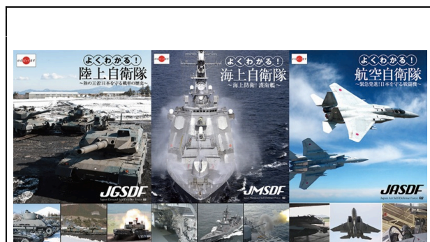
These DVDs issued in 2013 promote Japan's Ground Self-Defense Forces, Maritime Self-Defense Forces, and Air Self-Defense Forces under the slogan "Understand well!"

Neither Washington nor the conservative government in Tokyo anticipated that popular support for the anti-militarist ideals embodied in Article 9 would block constitutional revision once Japan regained its independence, and would continue to do so for decades to come. The ensuing debate has rattled Japanese politics for over six decades. Failure to revise the constitution has not prevented the government from engaging in "revision by reinterpretation" and creating a technologically advanced military with a continually redefined mission. At the same time, the constitution has retained sufficient influence to place restraints on both the weaponry these "self-defense forces" can acquire and the missions in which they can participate (such as supporting the United States and United Nations militarily in overseas conflicts).