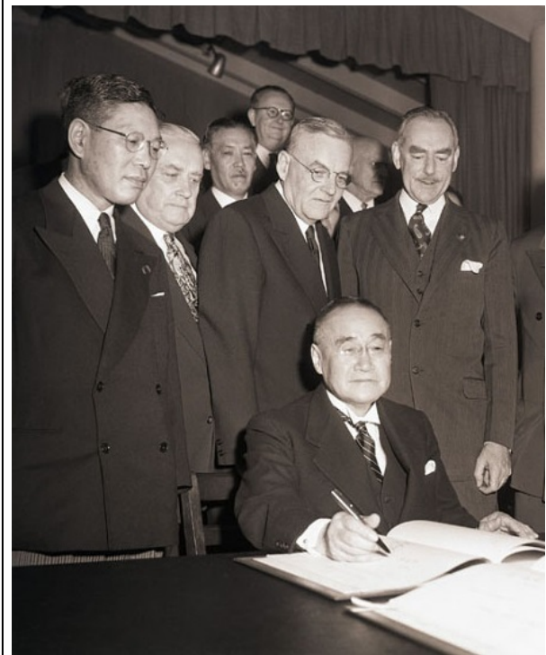
Prime Minister Yoshida Shigeru signs the bilateral security treaty with the United

The San Francisco System takes its name from two treaties signed in San Francisco on September 8, 1951, under which the terms for restoring independence to Japan were established. One was the multinational Treaty of Peace with Japan that forty-eight "allied" nations signed with their former World War II enemy. The second was the bilateral U.S.-Japan Security Treaty, under which Japan granted the United States the right to "maintain armed forces ... in and about Japan," and the United States supported and encouraged Japanese rearmament.