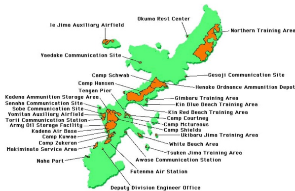
Left: U.S. Bases in Japan as of 2011. Right: Bases in Okinawa as of 2012.