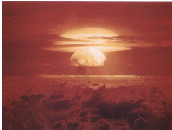
The "Castle Bravo" U.S. thermonuclear test over Bikini Atoll on March 1, 1954, that irradiated crew of the Japanese fishing boat "Lucky Dragon #5."

Chinese intervention would create "a unique use for the atomic bomb." Five months later, shortly after Truman's inflammatory press conference, MacArthur actually submitted a plan to the Joint Chiefs of Staff that projected using thirty-four atomic bombs in Korea. By the end of March 1951, at the height of the conflict, atomic-bomb loading pits had been made operational at Kadena Air Base in Okinawa, lacking only the nuclear cores for the bombs. The following month, in a significant departure from previous policy, the U.S. military temporarily transferred complete atomic weapons to Guam. 20