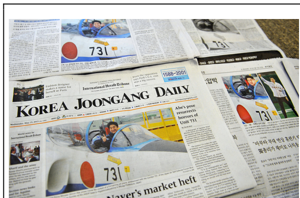
Korean press coverage of Prime Minister Abe Shinzō's inflammatory May 2013 photo shoot in a jet fighter. The plane bears the same ID number as the Imperial Army's notorious "Unit 731" that was based in Harbin and conducted lethal experiments on prisoners during the Asia-Pacific War.

amnesia. In the favorite adjective of official Washington, the San Francisco treaty was to be a "generous" peace. When participating countries such as Britain and Canada recommended that the peace treaty include "some kind of war guilt clause," the Americans opposed this idea. 15