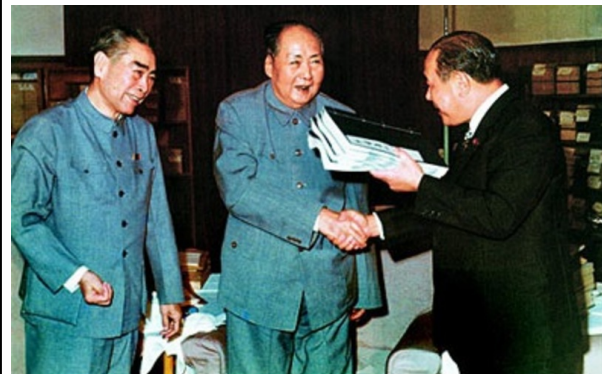
Zhou Enlai and Mao Zedong meet with Prime Minister Tanaka Kakuei in Beijing in September 1972, following U.S. abandonment of the containment policy.

Japanese as a people, given their "drive and a history of expansionism," would be "susceptible to the demands of the militarists." At one point, in responding to Zhou's expressed concerns, Kissinger delivered an extended indictment of the Japanese national character. He observed that "China's philosophical view had been generally global while Japan's had been traditionally tribal," described Japan as a nation "subject to sudden explosive changes," and declared that the Americans "had no illusions about Japanese impulses and the imperatives of their economic expansion." When Zhou opined that the U.S. nuclear umbrella tended to make Japan more aggressive toward others, Kissinger declared that the alternative was "much more dangerous. There was no question that if we withdrew our umbrella they would very rapidly build nuclear weapons." Absent the restraint of the bilateral security treaty and U.S. bases in Japan, there was no way of predicting what Japan might do beyond near certainty that it would be destabilizing.