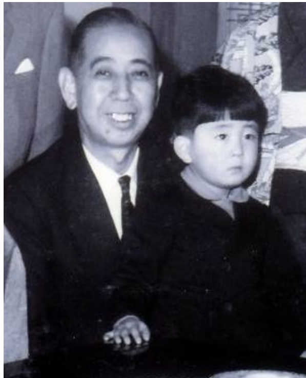
Prime Minister Kishi Nobusuke with his grandson Abe Shinzō. Abe served as

prime minister in 2006-7 and returned to the premiership in the closing days of 2012.