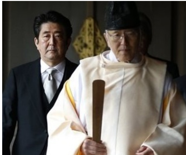
Prime Minister Abe visiting Yasukuni Shrine on December 26, 2013.