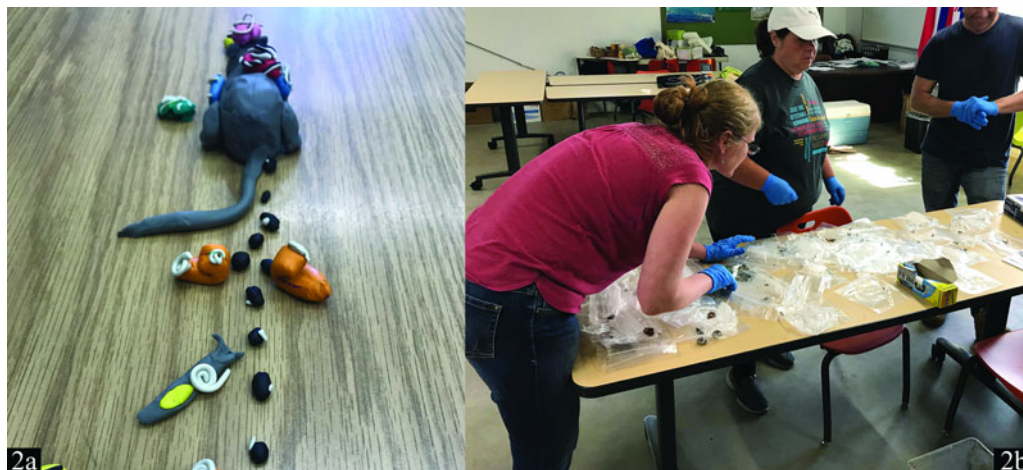
Fig. 2. (a) Teachers recreate the RLW life cycle using modelling clay. (b) PDE3 course instructor identifies slugs and snails captured during the hunt with course participants.

were identified. Teachers collaborated on a lesson development activity and wrote reflections at the end of each workshop day.