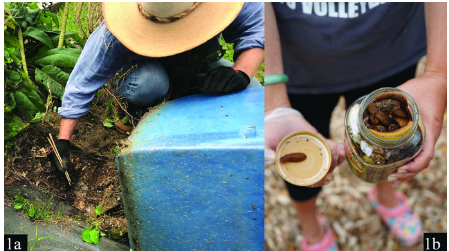
Fig. 1. (a) A teacher uses chopsticks to safely pick up slugs. (b) A jar full of Cuban slugs is captured during a slug hunt in a school garden.