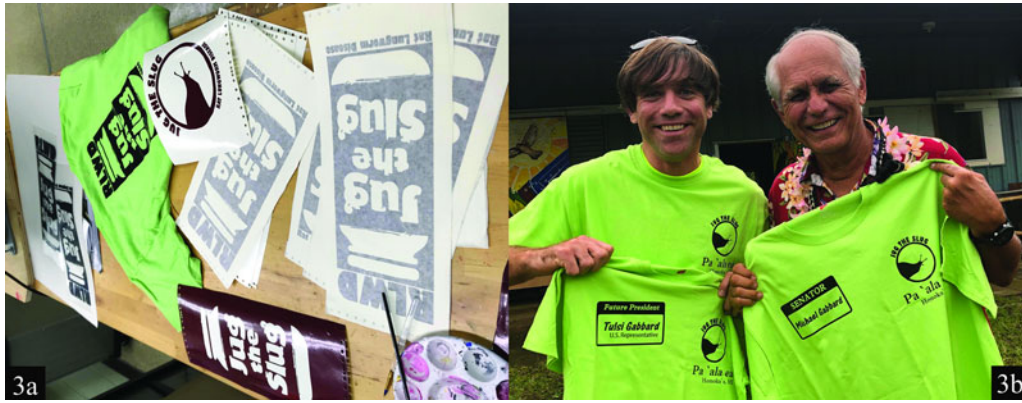
Fig. 3. (a) High school graphic arts students create RLWD prevention stickers and T-shirts with their 'Jug the Slug' logo. (b) High school graphics art teacher and PDE3 course participant presents Hawaii Senator Mike Gabbard with a t-shirt created by students.

data collection and ArcGIS story mapping. Hands-on activities, demonstrations, observations, collaborations and discussions similar to those described for the PDE3 course were conducted in a more condensed format.