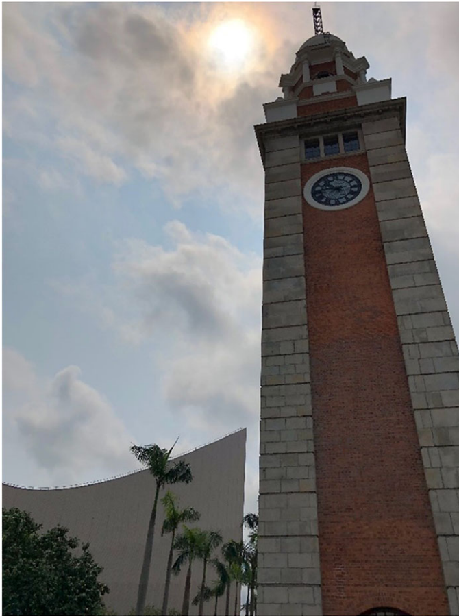
Figure 1. The Clock Tower (Right) and the Cultural Complex (Left) in 2020.

which will enrich the community's life and the public 'have no particular affection for the old station'." 71