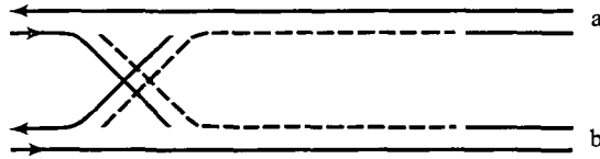
Fig. 3. Configuration of recombining chromatids with gaps in nucleotide chains of unlike polarity, according to Whitehouse (1963).

strand or four-strand double cross-overs on either model, but no three-strand double cross-overs. The general absence of chromatid interference implies that two of the four chromatids are chosen at random for any event.