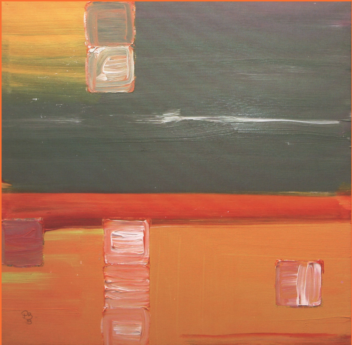
'Apples, bananas, pears, Brendan' (2003) by Paul Byrne (acrylic on canvas, 50 x 50cm) From an exhibition entitled 'What's in the Box II' at The James Joyce house of 'The Dead', 15 Usher's Island Art Gallery, Usher's Island, Dublin 8.