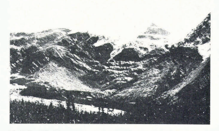
Fig.1(b) Illecillewaet Glacier 1931 (Wheeler 1932).