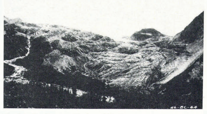
Fig.1(c) Illecillewaet Glacier 1946 (C.E. Webb unpublished report).