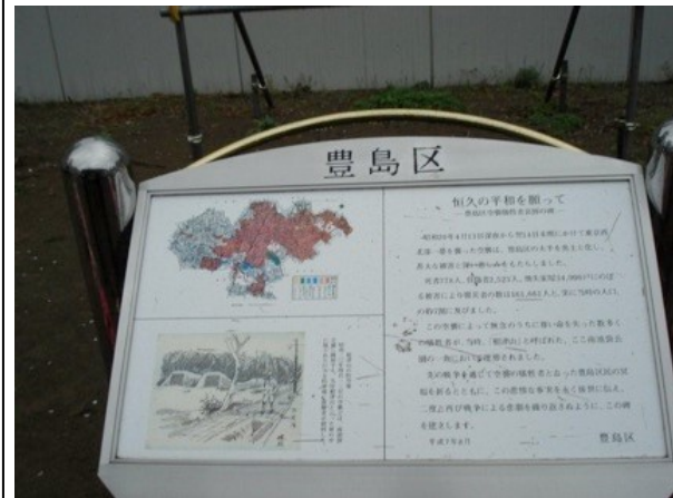
Memorial plaque for the victims of the April 13-14 air raid in Minami-Ikebukuro Park. The map at the top left shows the burned area of Toshima ward in red.

Nezuyama was the local name for a thickly wooded area to the east of Ikebukuro Station. During the war, four large public air raid shelters were built there. On the night of the air raid, hundreds of people fled from the fires to the shelters. The heat of the conflagration around Nezuyama was so intense that whirlwinds raged through the woods. The following morning, the bodies of 531 people who perished in the fires in the surrounding districts were temporarily buried in a field at the southwest corner of the woods. All that remains of Nezuyama is that space, now Minami-Ikebukuro Park, where they hold the memorial service every year.