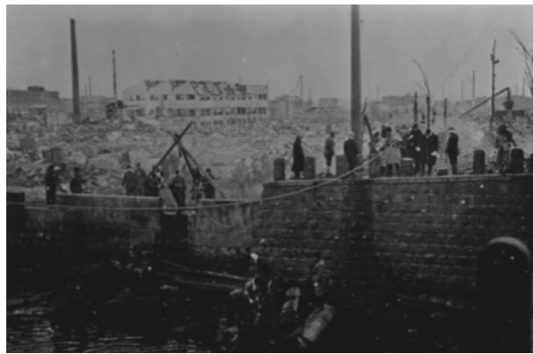
Bodies being removed from the canal below Kikukawa Bridge, March 17, 1945

get to them, dying of asphyxiation as the fires sucked the oxygen out of the air. Others died of shock from the coldness of the water, froze to death, or drowned. 51 The grid-like network of waterways also hindered escape because the bridges soon filled with people, making it impossible to cross quickly. Several thousand people died in the conflagration on top of Kototoi Bridge over the Sumida River, and as many as two thousand perished on Kikukawa Bridge and in the Oyokogawa canal below. 52 A week after the air raid, bodies were still being pulled out of the canal.