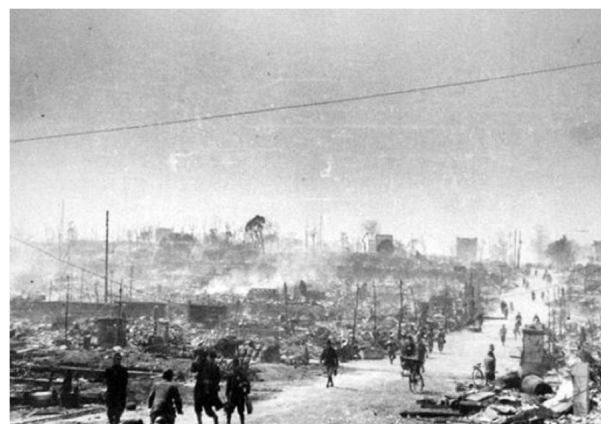
The ruins of Ichigaya in Ushigome ward, April 14

percent. 46 Two months after the end of the war, the Chemical Section of the Twentieth Air Force conducted a survey on the incendiary attacks against Japanese urban industrial areas. To determine the efficacy of Mission No. 67 (Perdition), they visited Tokyo Arsenal No. 1 in Jujo (Target 206). In interviews with Japanese army personnel, they found that only two B-29s had actually bombed the plant and that none of the 500-pound explosive bombs had hit the arsenal installations. Nevertheless, production had fallen by more than 50% after the air raid, partly because about half of the workforce did not return to work. Regarding the area damaged, this was the first US survey to point out, albeit cautiously, that the bombing had been inaccurate: "11.4 square miles was burned over in this attack, but a portion of this damage was in urban areas southeast of the general target area and somewhat short of the selected aiming points." 47 As US documents themselves confirm, this "portion" was much more extensive, accounting for about half of the total area, and the damage "somewhat short" of the aiming points was as far as six miles away.