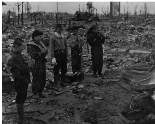
A cremation in the ruins in Nishi-Sugamo, mid-April 1945