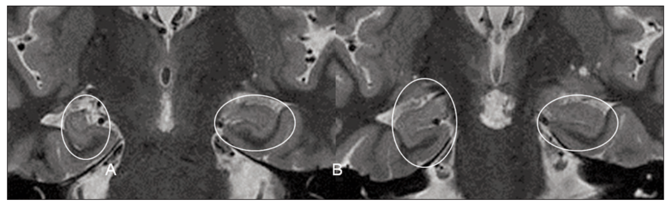
Figure 1: Hippocampal malrotation (HIMAL). 3T MRI of two coronal cuts (A and B) through the anterior third of the hippocampi. Note the right hippocampus (on the left side of the images) has an abnormal vertical orientation. All of the features in the strict characterization of HIMAL proposed by Barsi<sup>17</sup> are also present: unilateral involvement, incomplete rotation of a hippocampus with abnormal round shape; normal size and signal intensity and blurred inner structure.

include the same AP level of the hippocampus on the same slice. In addition, isotropic sagittal high resolution T1 FSPGR sequences (1 mm thickness, isotropic voxels TE/TI/FA: (Min/450/12,1mm slice thickness, 256x256 Matrix)), and standard axial diffusion weighted and T2 * weighted gradient echo sequences were obtained.