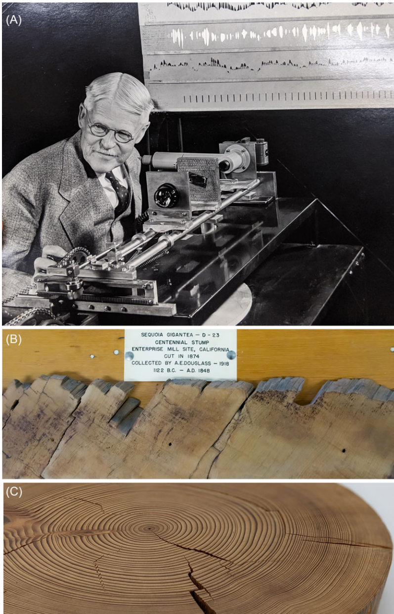
Figure 1 Early tree-ring and radiocarbon interactions: (A) Andrew Ellicott Douglass with his Cycloscope (1935), designed with the over-riding aim of discovering predictable cycles of solar activity in patterns of tree-ring growth, with emphasis on the 11-year solar cycle and its impact on climate (see Webb 1993 for further details). (B) Centennial Stump from California's Sierra Nevada used by Willard Libby in the first radiocarbon calibration, the "Curve of Knowns" featured in his Nobel prize speech in 1960. Note the large notches along the top edge of the sample created by the radiocarbon sampling. (C) Sample from "Broken Flute Cave," an Ancestral Puebloan cliff dwelling in the Prayer Rock district of the Navajo Nation in Arizona, also used in Libby's Curve of Knowns.